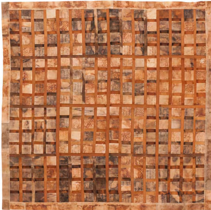
Memory Cloth 2010