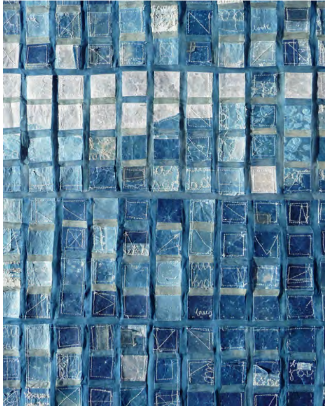
Postcards from the Blue (detail) 2010