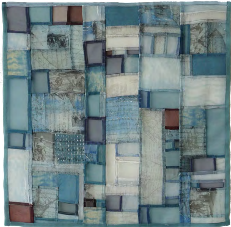
Small Moments, Big Story 2012