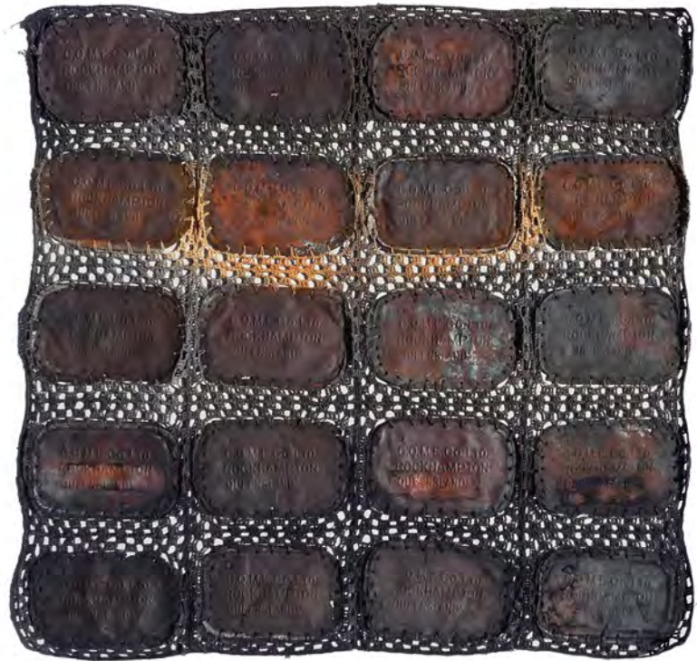
Supper Cloth 2009