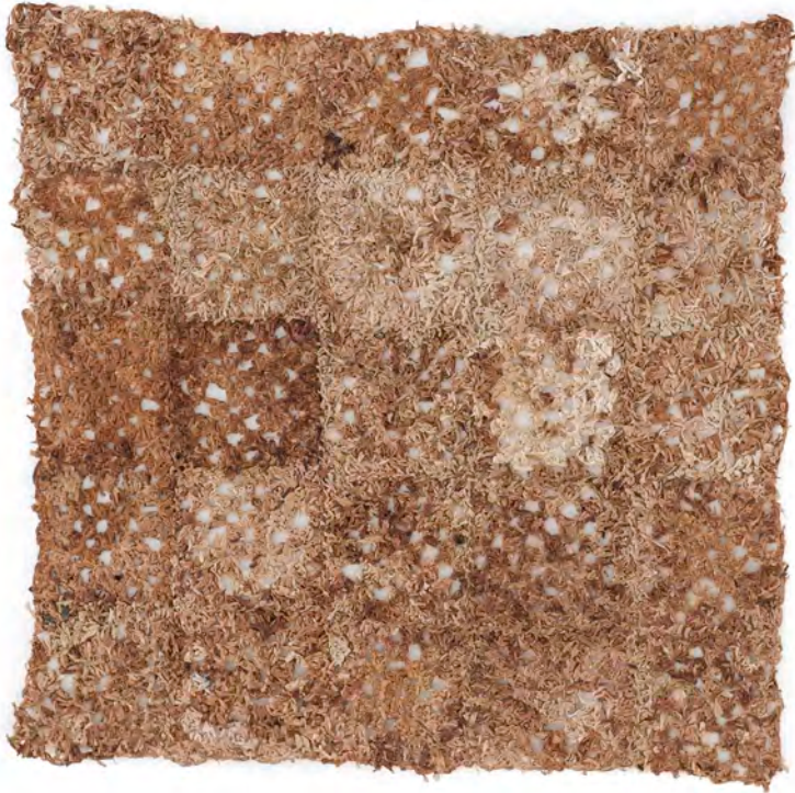
Recovery Cloth 2009