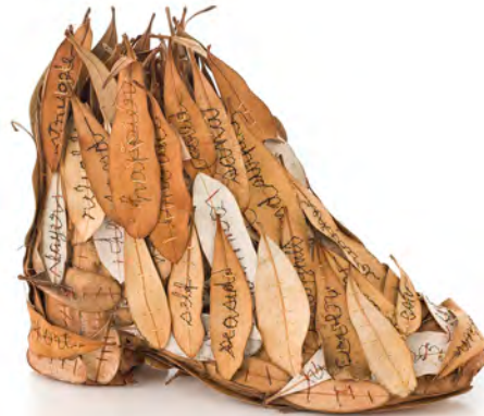
Banksia Stitched to the Soul 2003