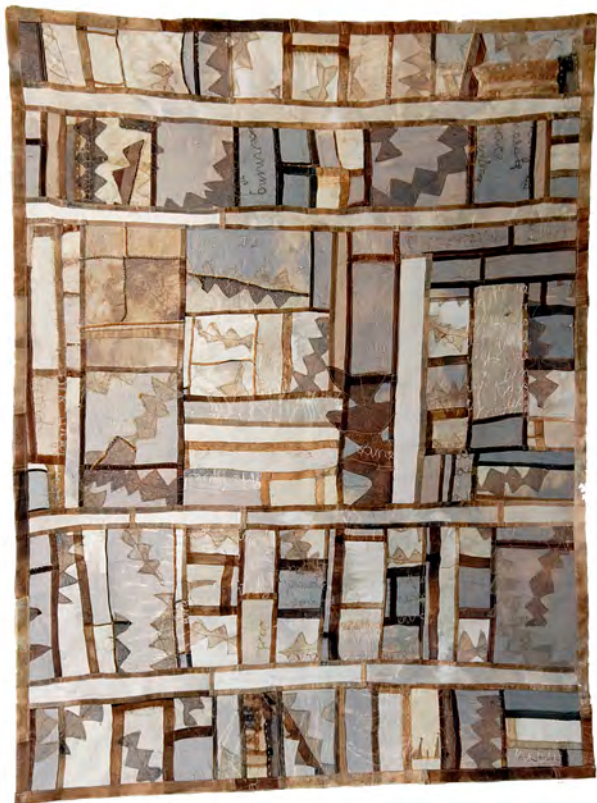
Sandplain Story 2011